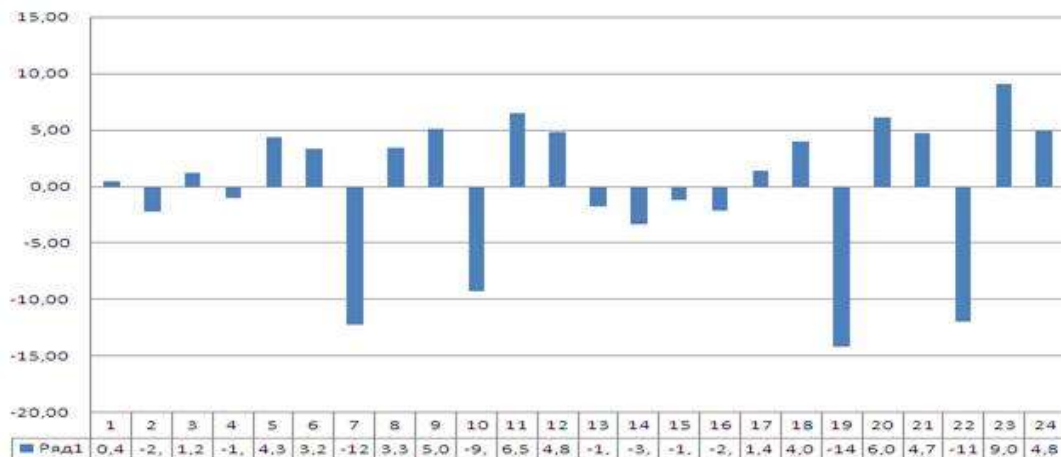
Rice. 3. The difference between the mean deviations of values for HCV and HBV disease.

When studying the differences in electrical conductivity deviations in groups of patients with established diagnoses of viral hepatitis C and B, the data presented in Fig. 3. In the figure, the ordinate represents the difference in the mean deviation of the measured conductivity value on the meridian between the groups with HCV and HBV, and the abscissa shows the numbers of the meridians presented in Table. one.