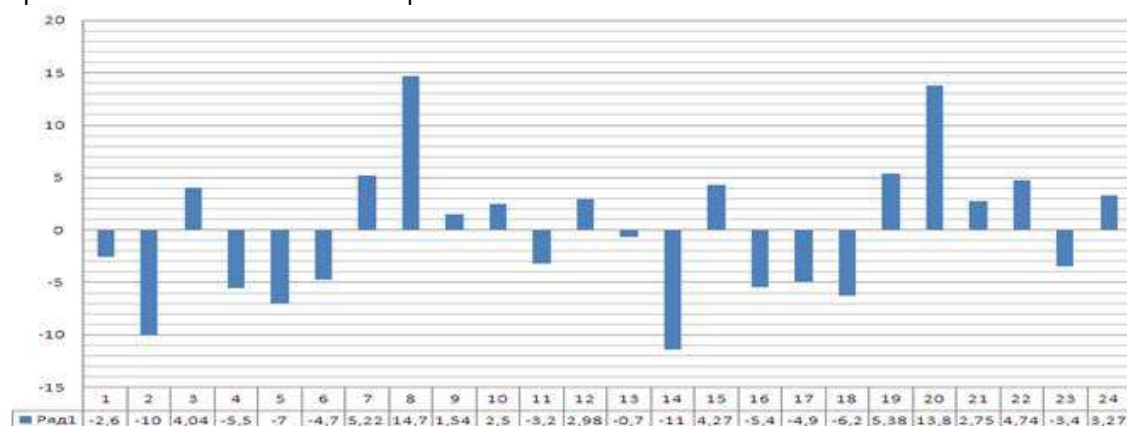
Rice. 2.Deviations of electrical conductivity values from the average in HBV disease.

In the study of a group of patients with viral hepatitis B (HBV), a pattern of violations along the meridians similar to that of HCV was obtained (Fig. 2). The average value of electrical conductivity in HBV patients was 54 conventional units, which is lower than the corresponding parameter in HCV patients. In fig. 2, the ordinate represents the mean value of the deviation of the measured conductivity value on the meridian from the mean value over all meridians, and the abscissa represents the meridian numbers presented in Table. one.