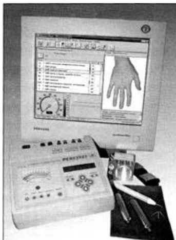
Rice. 1. External view of the "ARM-PERESVET" complex

In our opinion, a physician who possesses knowledge of traditional oriental medicine and homeopathy together receives additional opportunities for successful work, the purpose of which is to select a homeopathic remedy with maximum similarity.